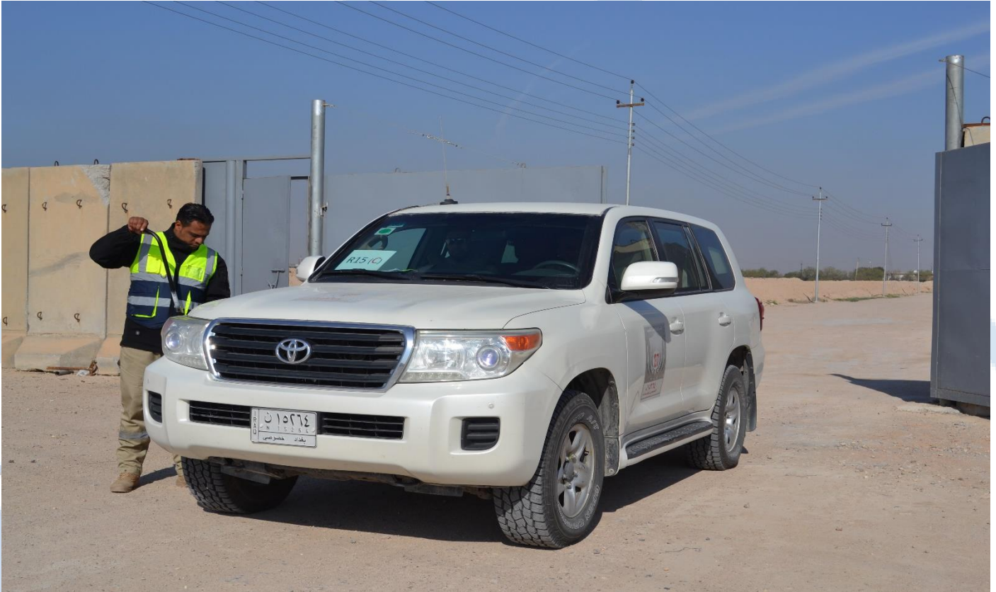
Main Access Gate onto Al Zubayer Business Park